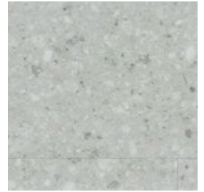
#2414 (Tile) Pergamon Stone