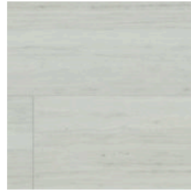
#2413 (Tile) Orsay Stone