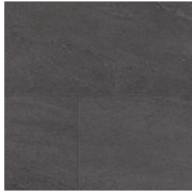
#2412 (Tile) Guggenheim Stone