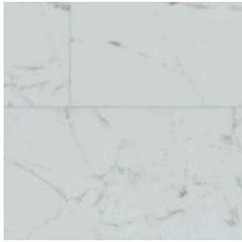
#2410 (Tile) Accademia Stone