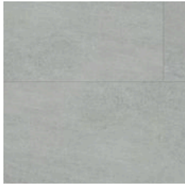
#2411 (Tile) Getty Stone