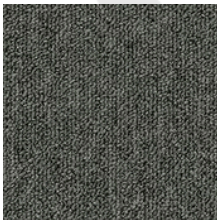
#A983 A983 Dropped Product