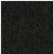
#A991 A991 Dropped Product