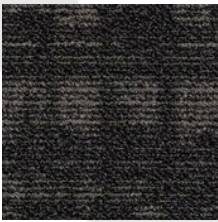
#01 Melanite Limited Stock