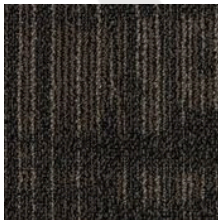
#04 Minotaur Dropped Product