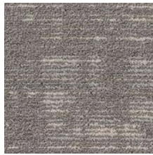
#06 Mindful Limited Stock