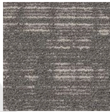
#05 Quiver Dropped Product