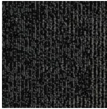
#T578 Black Spider