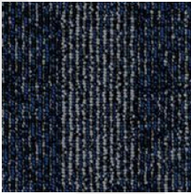
#T556 Deep Space