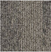
#T546 Straw Basket