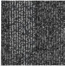
#T575 Gloomy Night