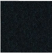
#A553 A553 Dropped Product