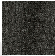
#A989 A989 Dropped Product