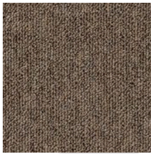
#A823 A823 Dropped Product