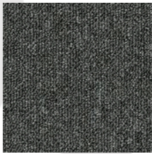
#A942 A942 Dropped Product